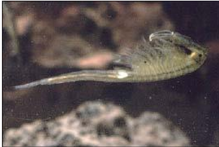
Vernal Pool Fairy Shrimp